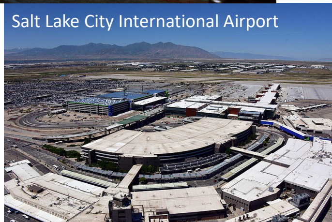
Salt Lake City International Airport