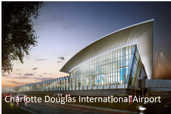
Charlotte Douglas International Airport