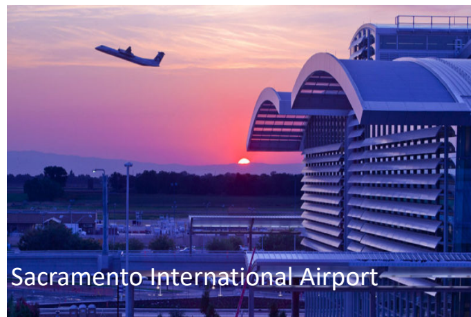
Sacramento International Airport